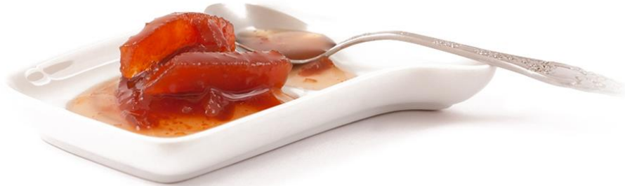
Quince Preserves product of organic farming

The nutritional value of the fruit is mainly to vitamin C it contains. Quince contains many tannins, vitamins A and C, fiber and few sugars. Soothe irritated stomach and facilitate hepatic and renal function. From carefully selected ripe fruits, organic farming, certified by the Certification Organization DIO. A creation of BIO SERRES. With organic sugar cane and taste. After opening keep refrigerated.