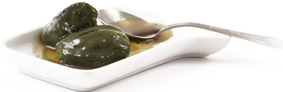
Kiwi Preserves product of organic farming

It is a very healthy and very Kiwi helps our organization. It contains more vitamin C of all fruits and rich in potassium, fiber, magnesium, phosphorus and trace elements. The small black seeds are rich in omega-3 fats, which are very important for good heart health. From carefully selected ripe fruits, organic farming, certified by the Certification Organization DIO. With organic sugar cane. After opening keep refrigerated.