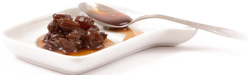
Grape Preserves product of organic farming

Organic sweet grapes, a product with the reliability and quality chariot.