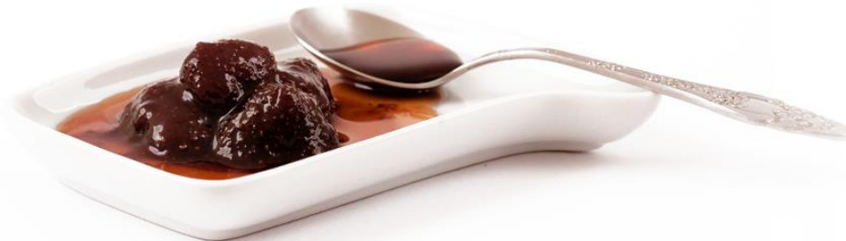
Strawberry Preserves product of organic farming

A lovely, fragrant sweet without preservatives, additives and chemicals. The strawberry, delicate and very useful, is one of the best sources of vitamin C for the human body. From carefully selected ripe fruits, organic farming, certified by the Certification Organization DIO. A creation of BIO SERRES. With organic sugar cane and taste. After opening keep refrigerated.