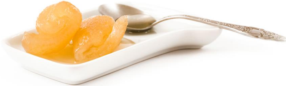
Lemon Preserves product of organic farming

A fragrant and very tasty lemon sweet that will pleasantly surprise you if you want to finish your meal with something light. From peels dialect chondrofloudis variety of ripe lemons, sugar and lemon juice, created for you this sweet with a unique sweet and sour taste. Try it and love it! After opening keep refrigerated.