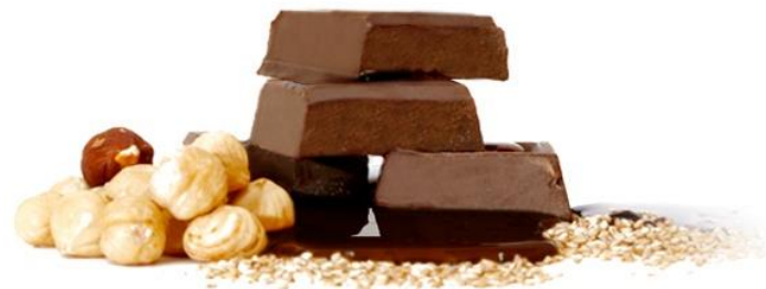
Chocopetino Vegan product of organic farming

Tsokopetino spread (tahini, molasses, cocoa, hazelnut). Unique combination of flavors for a nutritious breakfast for children but also for adults. Without preservatives and dyes. High quality product, unique and 100% Greek. Great taste you'll love.