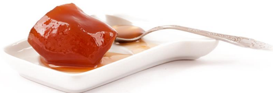
Firiki Preserves product of organic farming

Organic sweet Firiki. The Firiki is a specific variety of apple. The apple is characterized for its small size. The firiki is a very tasty, light and aromatic sweet. After opening keep refrigerated.