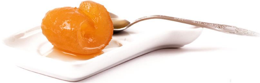
Bergamot Preserves product of organic farming

The aristocracy of sweets. A sweet with a wonderful aroma and taste that will surely impress everyone. It is ideal above sweets with creams. The syrup can be wetting the sponge or syrupy walnut pies, karydopites! From carefully selected ripe fruits, organic farming, certified by the Certification Organization DIO.