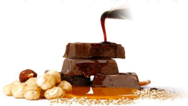
Chocopetino product of organic farming

Tsokopetino spread (tahini, molasses, cocoa, hazelnut, honey). Unique combination of flavors for a nutritious breakfast for children but also for adults. Without preservatives and dyes. High quality product, unique and 100% Greek. Great taste you'll love.