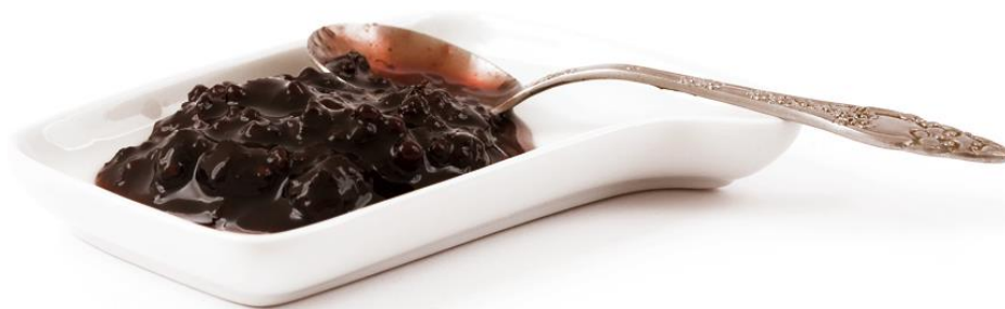
Blackberry Preserves product of organic farming

Blackberry is one of the favorite sweets of the Greeks, either accompany our afternoon coffee or gives color to our afternoon yogurt or beautifully decorates an ice cream. A vintage sweet, which has left its imprint on from generation to generation! From carefully selected ripe fruits, organic farming, certified by the Certification Organization DIO.